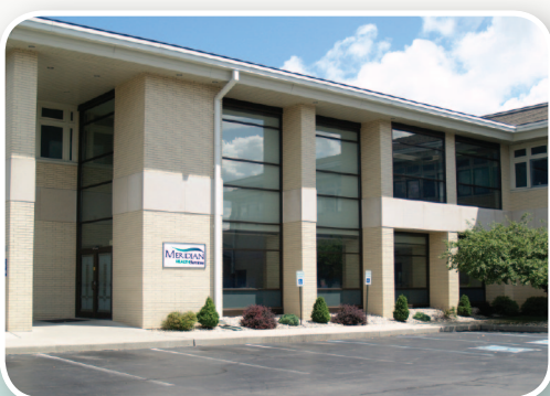
Main Office in Muncie